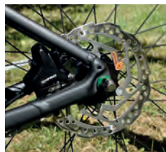
Top: The 3-speed hub gear is ideal for flatter towns and cities Bottom: Hydraulic discs give powerful, all-weather braking

That bottom gear is fine for quite gentle inclines but when things get steeper – as on my local routes – the effort required, especially if you're carrying shopping, will be challenging. You'll also need a 15mm spanner for rear wheel punctures, unless you patch the tube in situ.