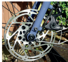
Top: Bottom gear is 26/36, which is fine for loaded touring Bottom: Tektro Spyre-C cable discs provide reliable braking

precise indexing throughout the range. The drivetrain shifts smoothly and that bottom gear bails you out on steeper climbs.