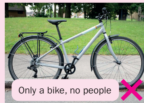
Only a bike, no people