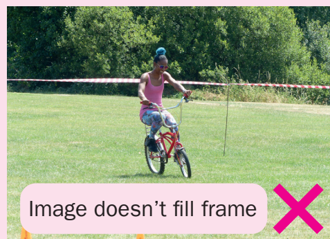
Image doesn't fill frame