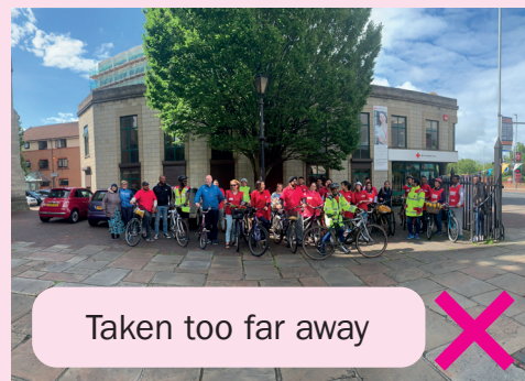
Taken too far away