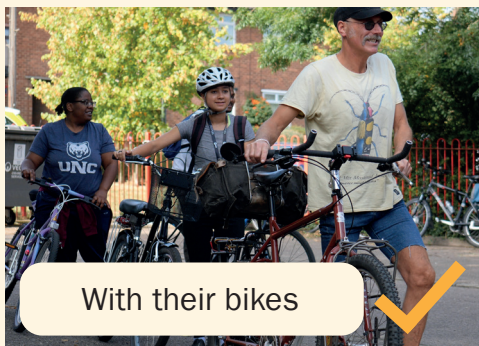
With their bikes