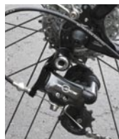
The groupset is Campagnolo Veloce throughout. If you want lower gears, you could fit a 13-29 cassette instead, even with this short-cage derailleur

The Corsa's frame is made from Toray unidirectional carbon, while the fork is carbon too with an alloy steerer. It's built to a racy geometry with steep