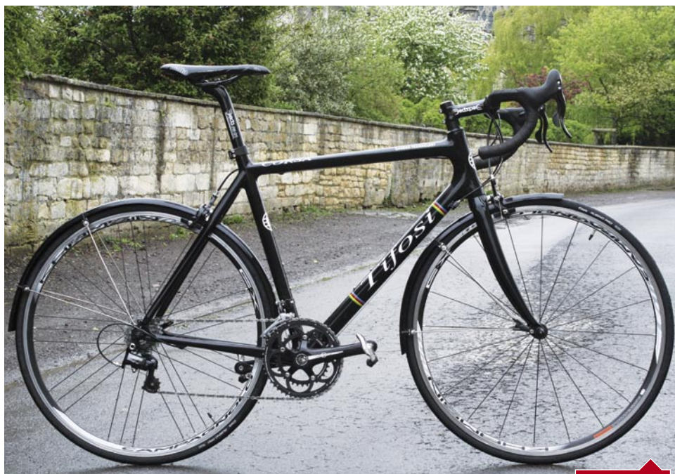
TIFOSI CK CORSA