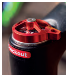
Above: As well as lockout, the easily adjustable air-sprung fork has rebound damping so it doesn't just pogo back up over bumps

T he last few years of primary school can be an awkward age for children's mountain bikes. Size XS adult bikes that may fit younger teens are still too large, while a junior, rigid-forked all-rounder may not cut it on singletrack trails with small drops and logs to ride over. Fortunately there are some children's hardtails with decent, air-sprung forks, such as Frog's MTB 69.