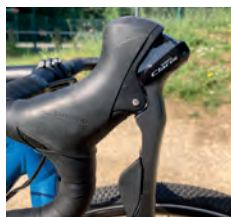
Above: Spacers in the levers bring them closer to the handlebar for smaller hands

T he Luath is a drop-bar all-rounder aimed at adult cyclists that much of the industry pays only lip service to: those under the average male height of 5ft 9in. It fits riders as short as 4ft 11in. Small frames typically come with off-the-peg components that feel oversized. Not the Luath. As well as a scaled-down frame, it has custom short-reach brake levers, a narrower handlebar, and shorter cranks.