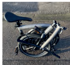
Above: The left-hand pedal quick releases from the crank and is stowed in the hole in the fork crown, which is magnetic

T he Brompton T-Line is much lighter than the part-titanium Superlight, now called the P-Line. That has a steel main frame; the T-Line's is titanium. With a carbon fork and lightweight bits, it weighs as little as 7.5kg.